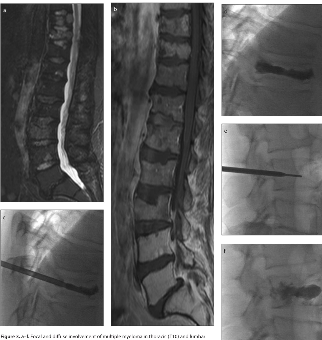
Figure 3. a–f. Focal and diffuse involvement of multiple myeloma in thoracic (T10) and lumbar (L3) vertebrae is shown as hyperintense signal on STIR sagittal image (a) and iso-hypointense diffuse involvement on sagittal T1-weighted image (b). PV was performed on T10 (c, d) and L3 vertebrae (e, f).

complications are usually asymptomatic. Complications during PV can be prevented by bringing the needle tip into the proper position under fluoroscopy (11). Other possible complications include vertebral transverse process or pedicle fractures, paravertebral hematoma, epidural abscess, pneumothorax, cerebrospinal fluid leakage, seizure because of oversedation or respira-